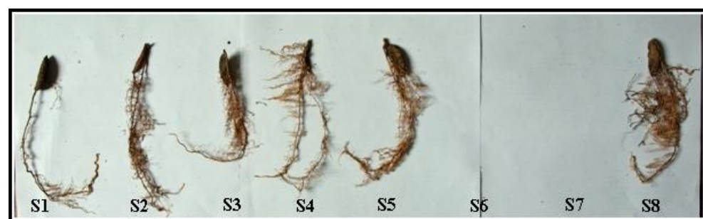
Plate 4: Influence of seed treatments on root growth in seed stored for 90 days