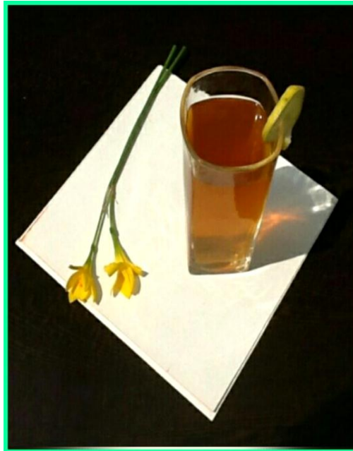
Herbal Drink (b)